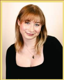
ISABELLA BLACK LADY MACBETH